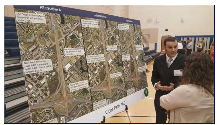
Clear Path 465 Public Open House, August 23, 2017